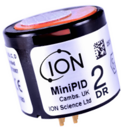
MiniPID 2 sensor