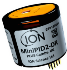
MiniPID 2 sensor